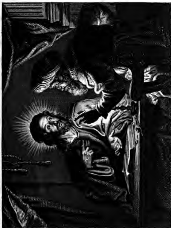
Engraving of Jesus at the table, after the model of the Bishop of the Vatican.